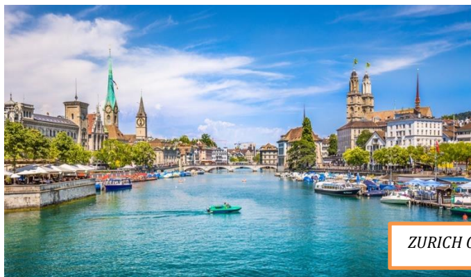
ZURICH CITY TOUR

Arrive Zurich Airport Meet the coach captain in the parking area Drive to the hotel Arrive hotel and Check in (post 1500 hrs) Orientation tour of Zurich Dinner at Indian restaurant Depart for hotel Arrive hotel Overnight in Radisson/Novotel Messe or similar in Zurich.