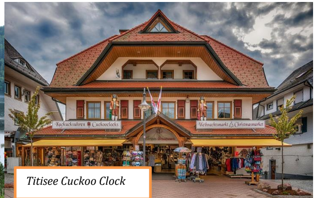
Titisee Cuckoo Clock