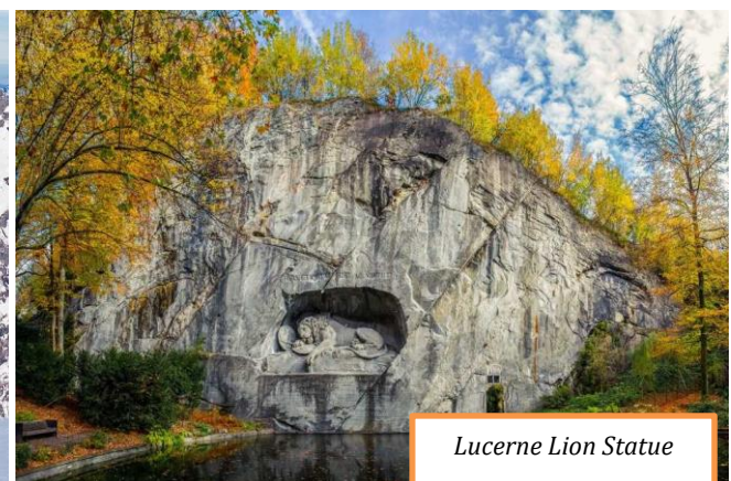
Lucerne Lion Statue