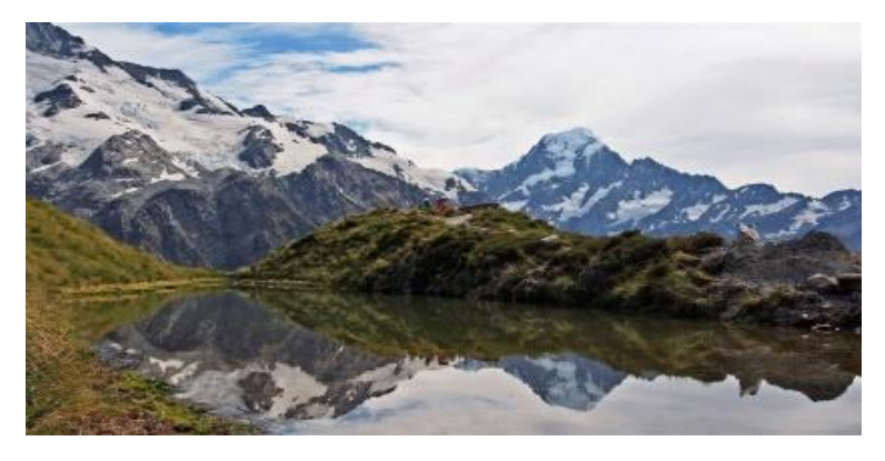
Day 6: Queenstown – via Aoraki/Mt Cook – Christchurch