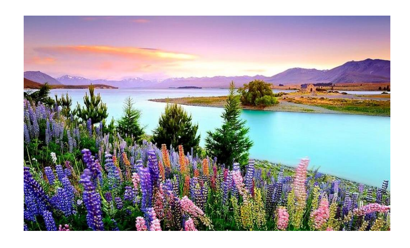
Day 2: Christchurch - Tekapo - Queenstown