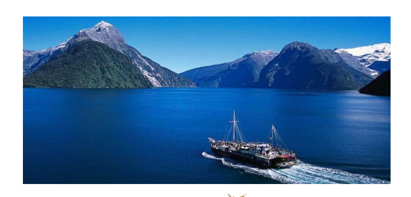
Day 3: Queenstown - Milford Sound - Queenstown