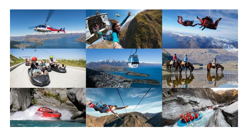
Day 5: Queenstown