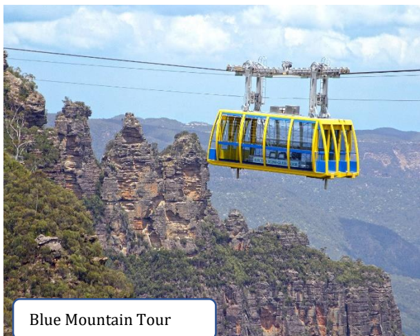
Blue Mountain Tour

Breakfast at Hotel Check out the Hotel Transfer to Canberra airport to board the flight to Sydney Arrive Sydney Airport Transfer to hotel Check in to Hotel (Standard time 14:00 hrs) Enroute Lunch at Indian restaurant time free at Leisure Dinner at Indian Restaurant Overnight at Hotel Holiday inn Pott point or similar.