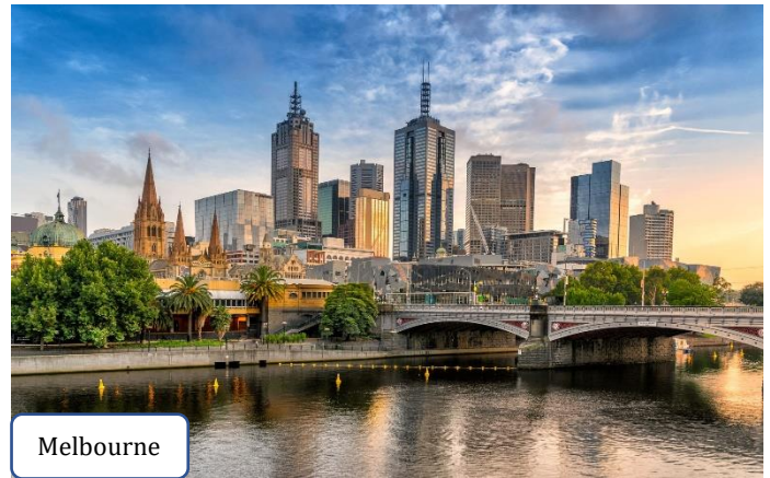
Great Ocean Road Tour

Arrive Melbourne Airport Transfer to hotel Check in to hotel (Standard time 14:00 hrs) Time free at Leisure Return Dinner transfers Dinner at Indian restaurant Overnight at Holiday In Express Melbourne or Similar.