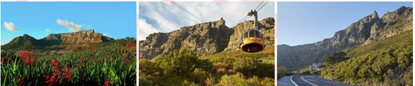
Table Mountain is the most iconic landmark of South Africa. Aside from being the country's most photographed attraction and the perfect place to take photos of the landscape of Cape Town, it is also home to about 2,200 species of plants and 1,470 floral species, many of which are endemic to the mountain. Animal species that can be spotted on the mountain include caracals, rock hyraxes and chacma baboons. The flat top peak of the mountain reaches 1,086 metres above sea level, but being so close to the sea and to the city, its features look more imposing.