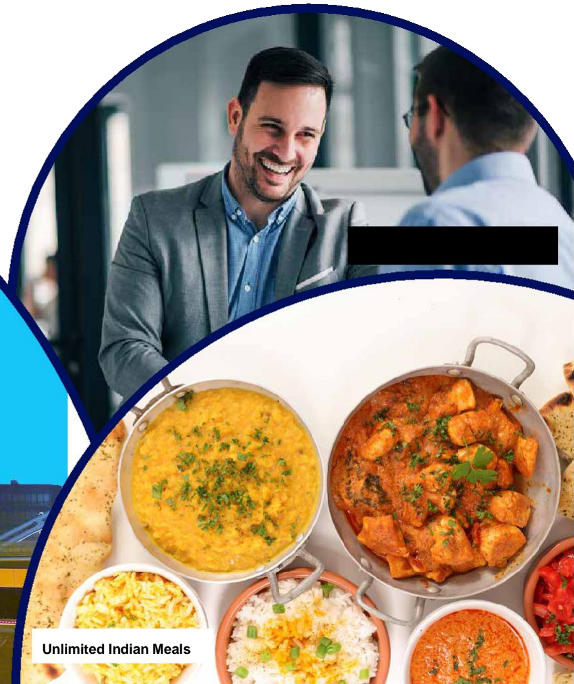
Unlimited Indian Meals