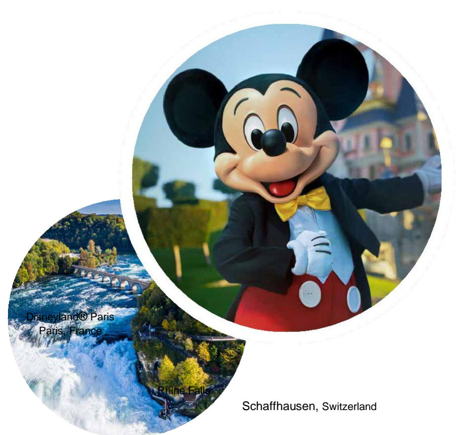
Disneyland® Paris Paris, France

Today we proceed for a guided city tour of Paris. Marvel at the finest Parisian tourist attractions, Place Vendôme, Place de l'Opéra Garnier, Musée d'Orsay, Place de la Concorde, Champs Elysées, one of the most recognised fashionable avenues in the world, Arc de Triomphe, Alexander Bridge, Les Invalides and several others. Next we visit the iconic Eiffel Tower – 3rd Level, and get a stunning view of the city from the top. With its famous tapering cast iron tip, the Eiffel Tower is not just the symbol of Paris but of all of France. Later in the day, visit Montmartre known for its artist's history. Take a Funicular to the top and see the white domed Basilica of Sacre-Coeur,