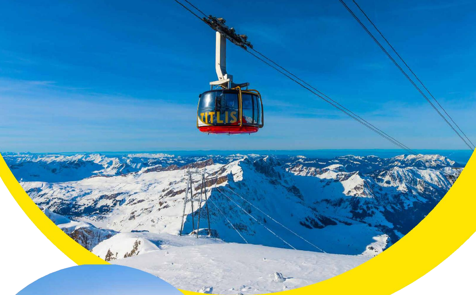
Mt. Titlis Engelberg, Switzerland