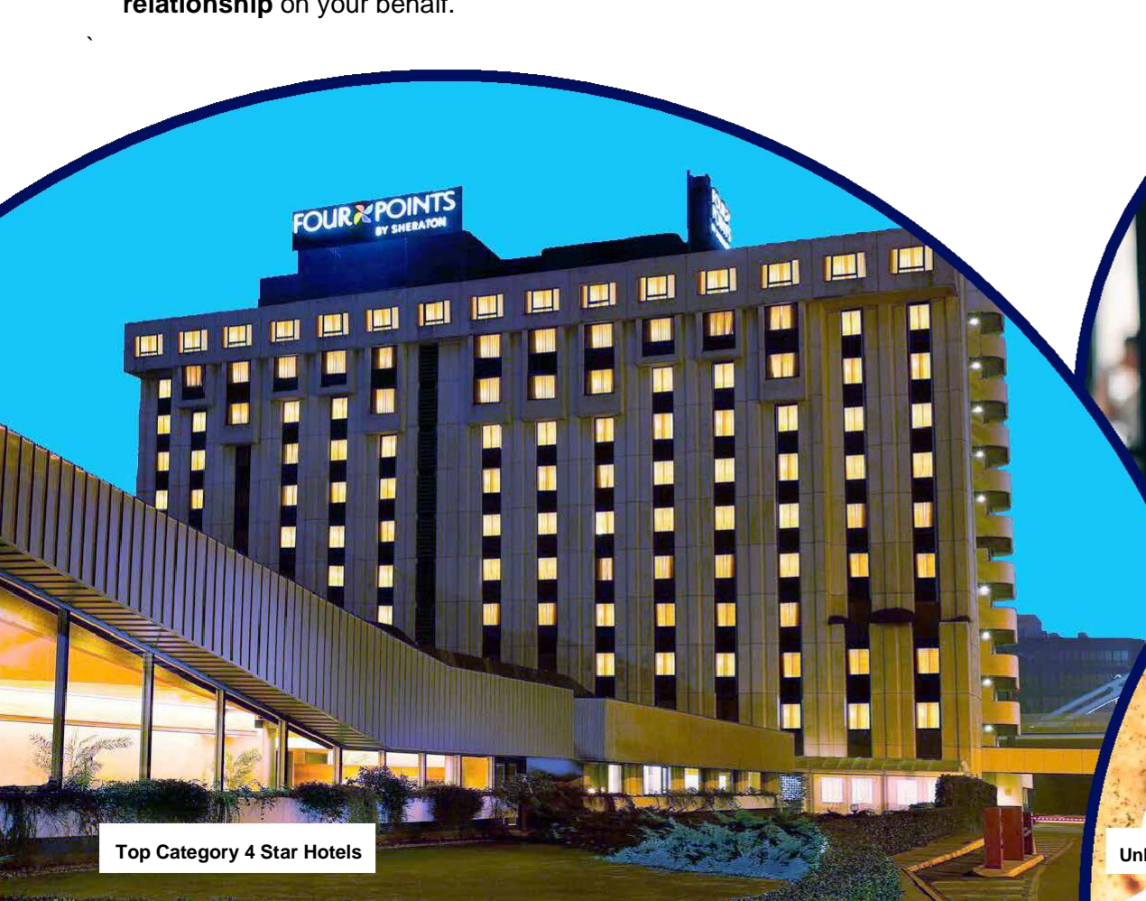
Top Category 4 Star Hotels