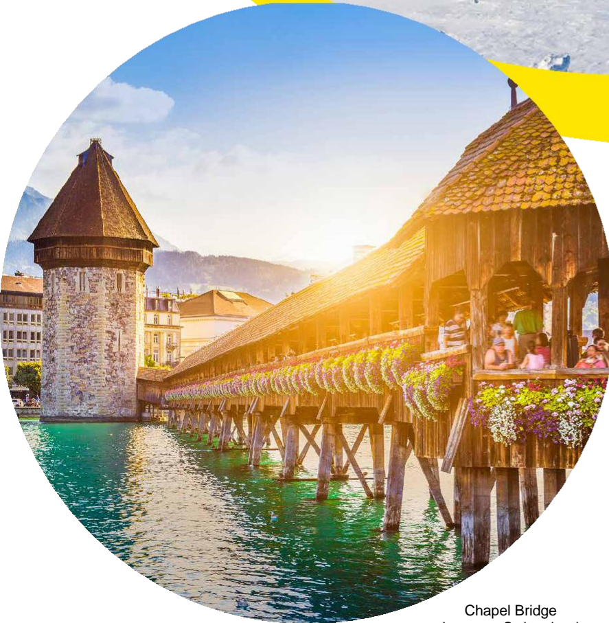
Chapel Bridge Lucerne, Switzerland