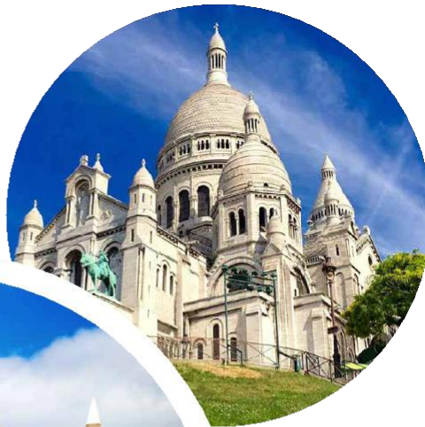
Sacre-Coeur Basilica Paris, France

a popular landmark and the second most visited Monument of Paris.